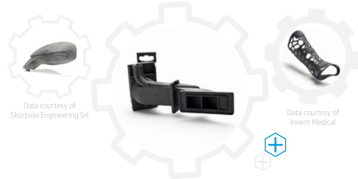
Data courtesy of Skorpion Engineering Srl