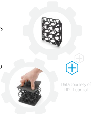
Data courtesy of HP - Lubrizol

Tested and approved solely for compatibility with HP Jet Fusion 3D printers 14