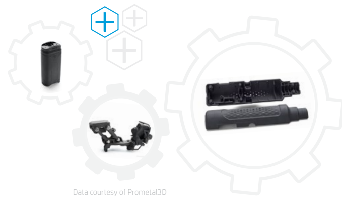
Data courtesy of Prometal3D

Statements: 9 Biocompatibility, REACH, RoHS (for EU, Bosnia-Herzegovina, China, India, Japan, Jordan, Korea, Serbia, Singapore, Turkey, Ukraine, Vietnam), PAHs, Statement of Composition for Toy Applications, UL 94 and UL 746A