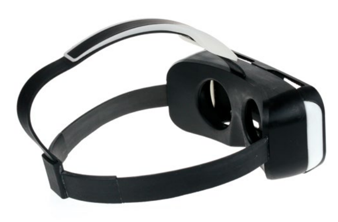
Different views of the prototype produced with Invicta DL380 in O29X 3D printer.