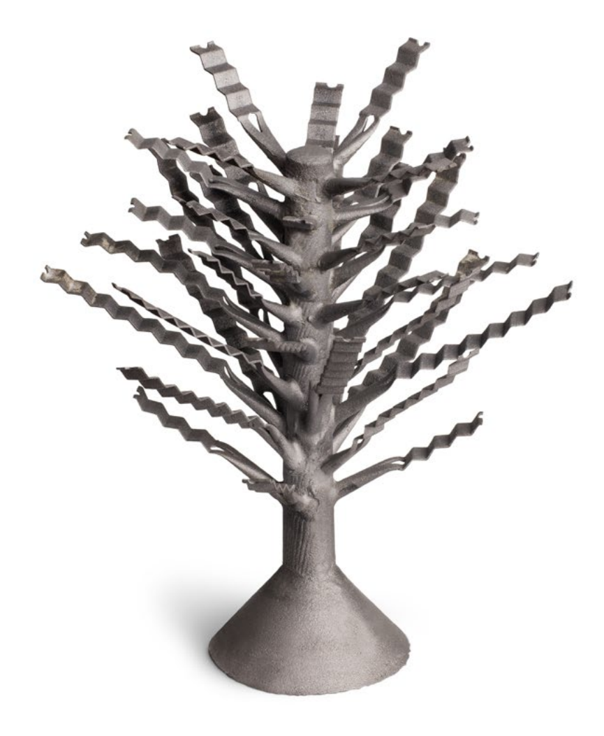
Castable models for industrial use made with DWS 3D printers and materials can be of refined and complex design.