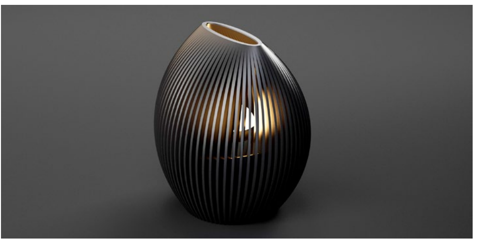
Alux's surface and details obtained with resin DL380 and produced in XPRO Q 3D printer.