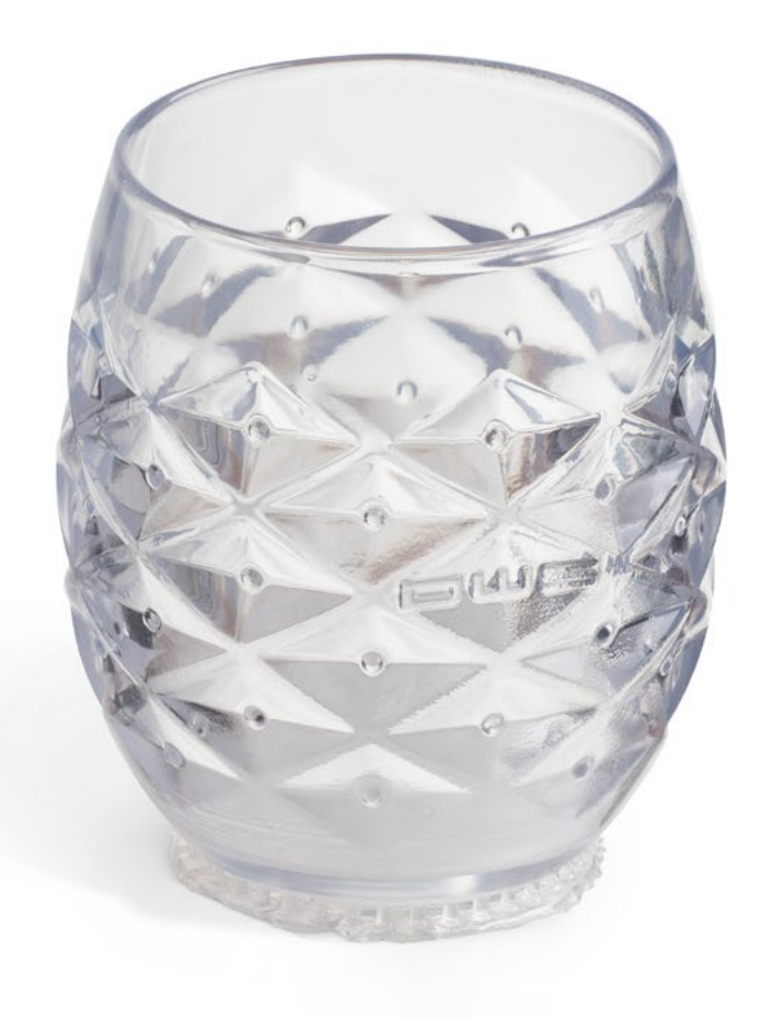
Strong and transparent like glass. An example of the possibilities offered by the combined use of DWS systems and materials.